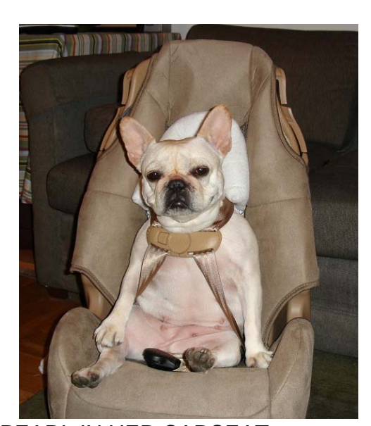
PEARL IN HER CARSEAT